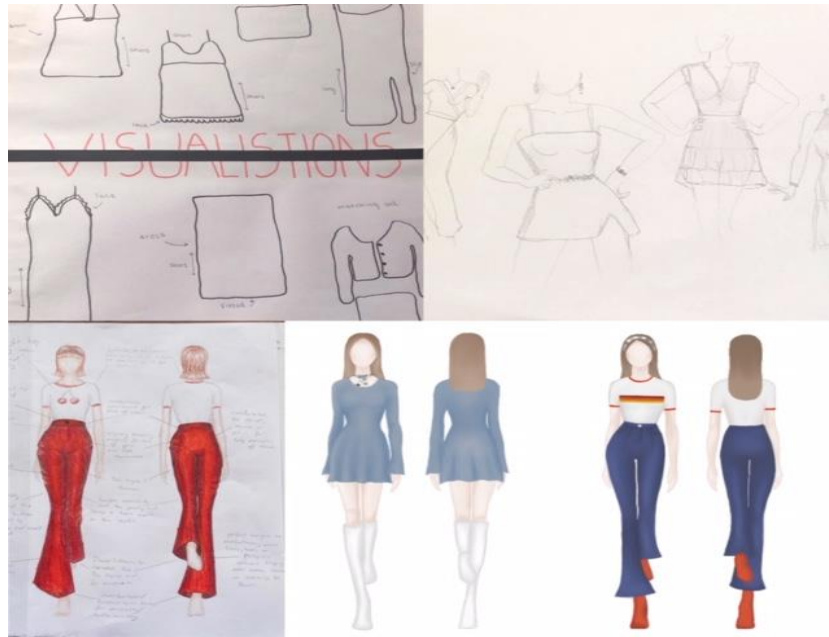
Amy Dallas Textiles Teacher

Not only are student's refining their skills in garment construction, but also in folio tasks such as visualisations and presentation drawings.